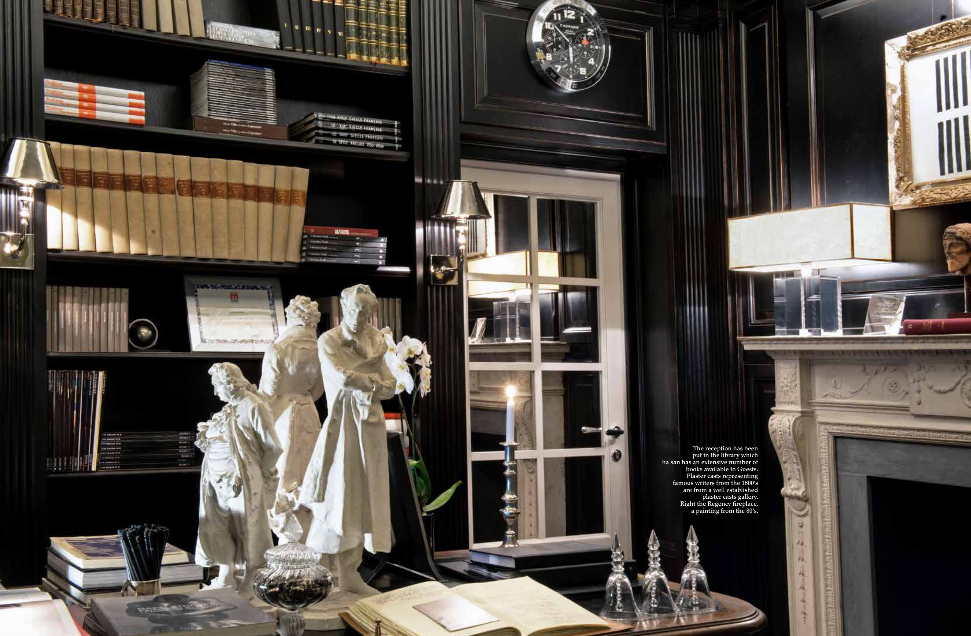
The reception has been put in the library which has an extensive number of books available to Guests. Plaster casts representing famous writers from the 1800's are from a well established plaster casts gallery. Right the Regency fireplace, a painting from the 80's.