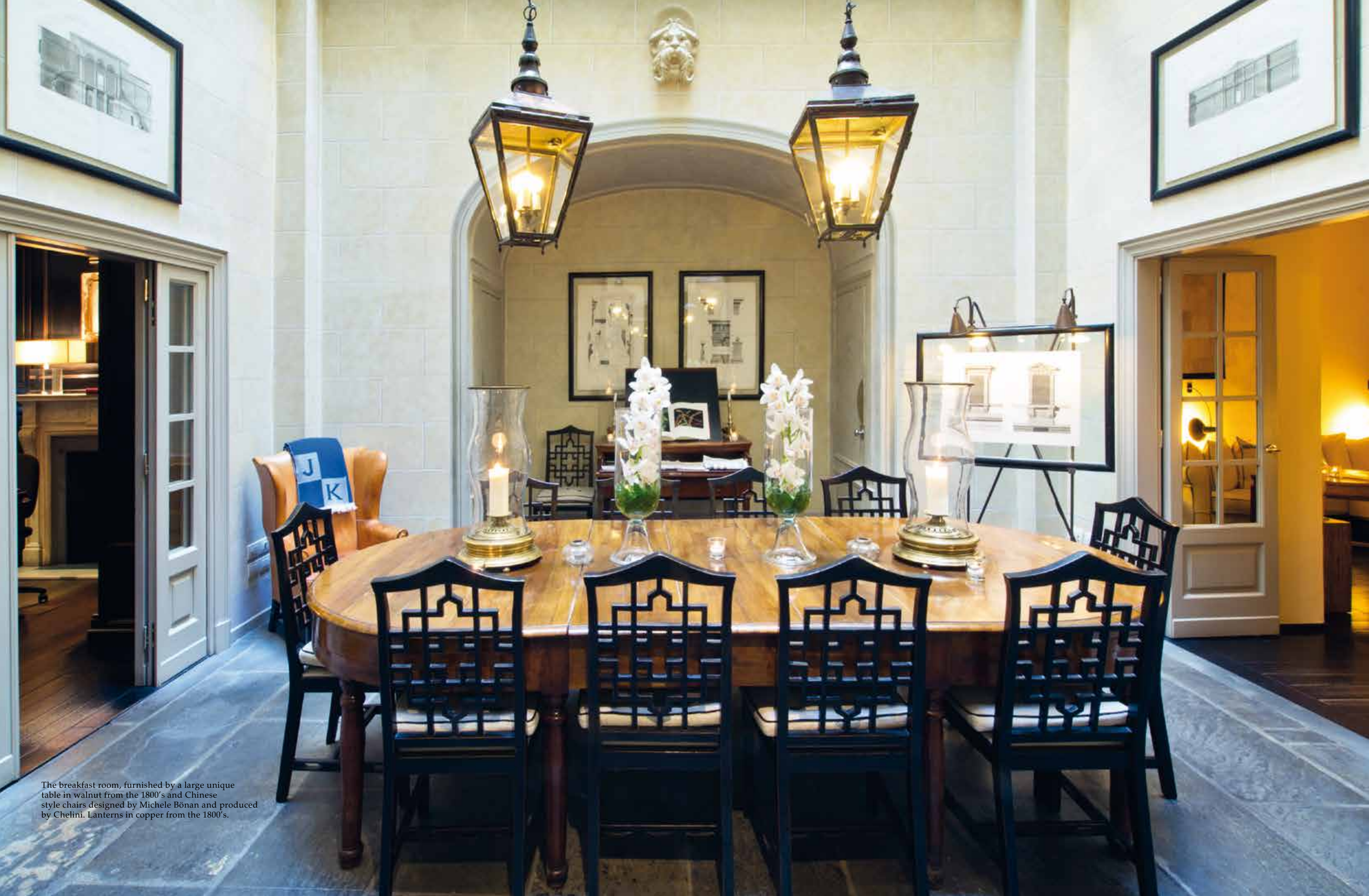
The breakfast room, furnished by a large unique table in walnut from the 1800's and Chinese style chairs designed by Michele Bönan and produced by Chelini. Lanterns in copper from the 1800's.