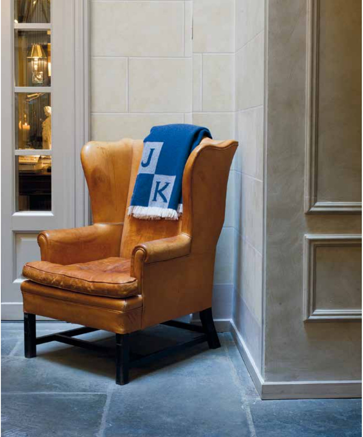
Armchair in natural leather with a loom-made, J.K. branded cashmere plaid from a local manufacture.