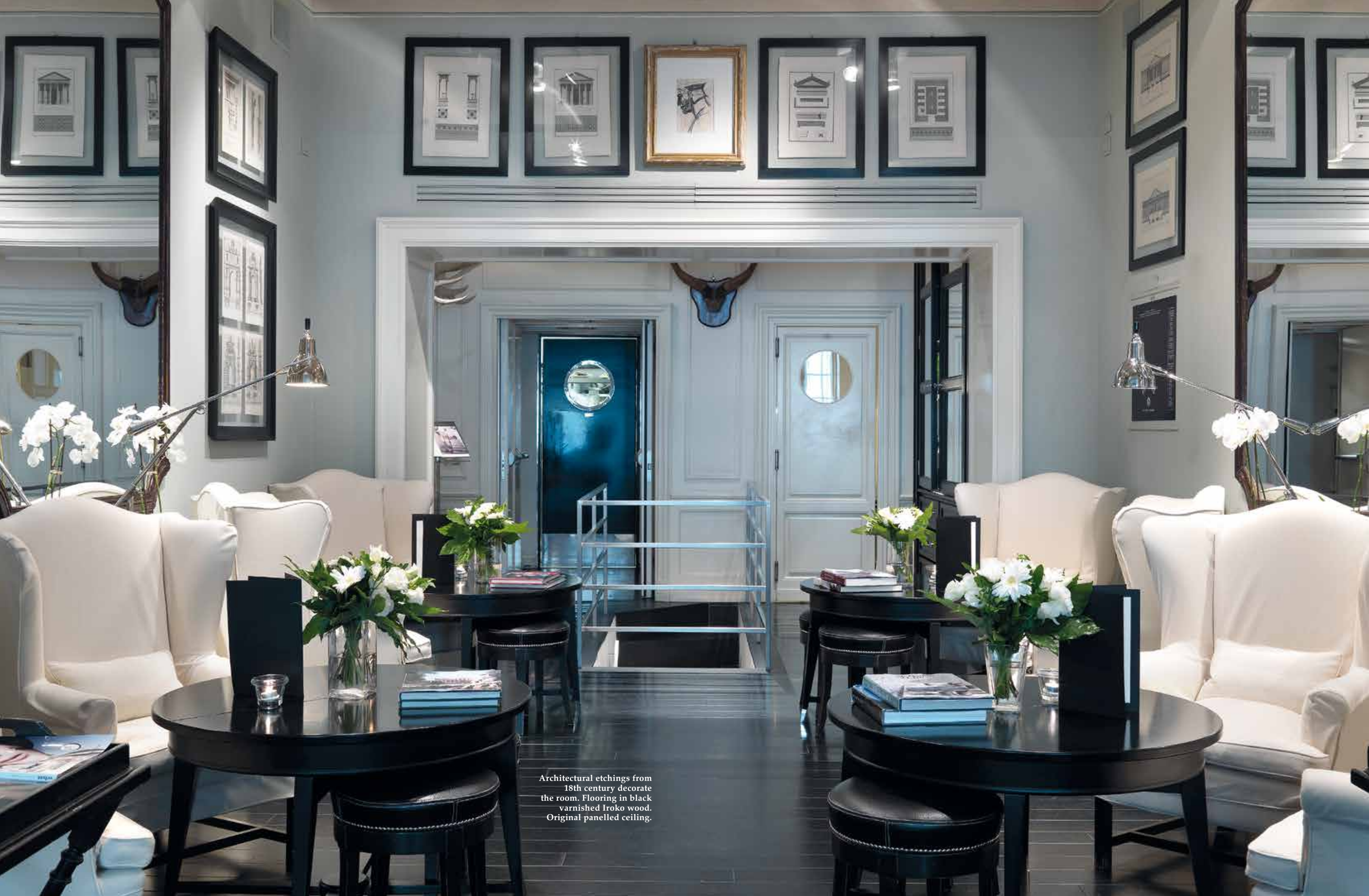
Architectural etchings from 18th century decorate the room. Flooring in black varnished Iroko wood. Original panelled ceiling.